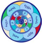
Sky Wheel Mandala

On the bottom of the 8-DVD stack is another circular paper cover. Facing up is the Earth Wheel Mandala in color (not accessible). The outlines of the Earth and Sky Wheel Mandalas were drawn by Lama Zopa Rinpoche 1 , following the instructions of the Fourth Panchen Lama. Facing down is information on the prayers in the 8-DVD stack and contact information for Tibet Tech LLC. The stack of covers and DVDs are glued together to ensure that all components of the 8-DVD stack are kept in correct order. Around the circumference of the 8-DVD stack is the Om Mani Padme Hum mantra in traditional Tibetan script.