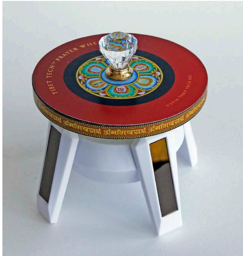
8-DVD Solar-Powered Tibet Tech™ Prayer Wheel