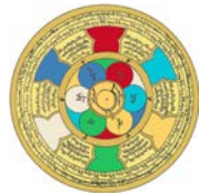
Earth Wheel Mandala